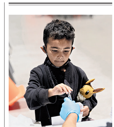
A student in San Antonio preparing to take a Covid-19 test.